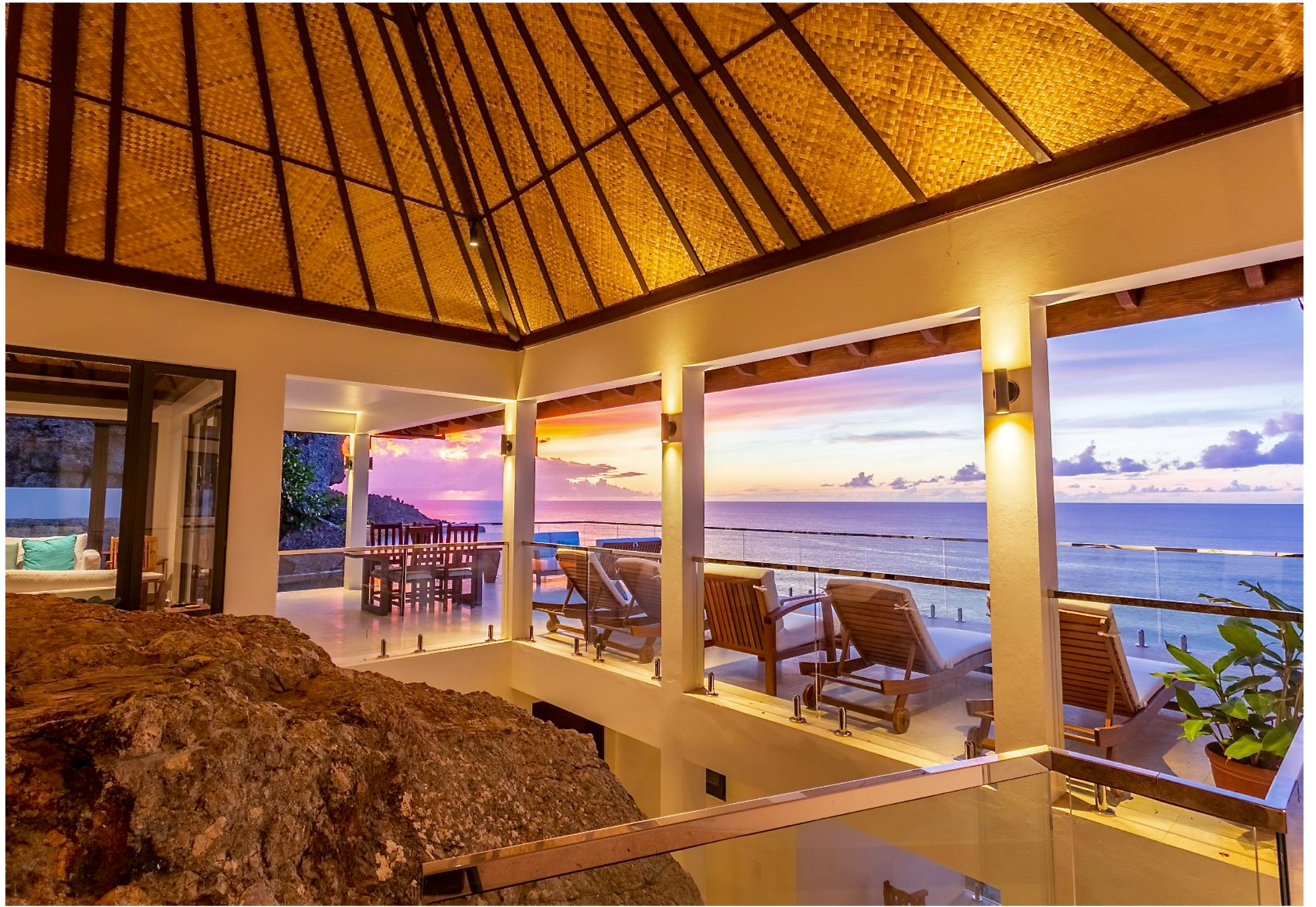
DP Works 2020 Cooper Bay Villa, Tortola, BVI.